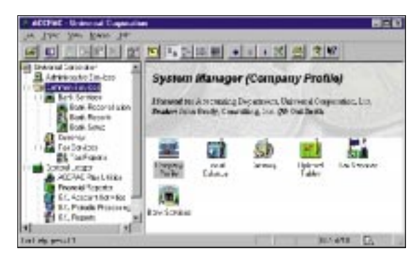
Common Services is the heart of your accounting system, simplifying system administration